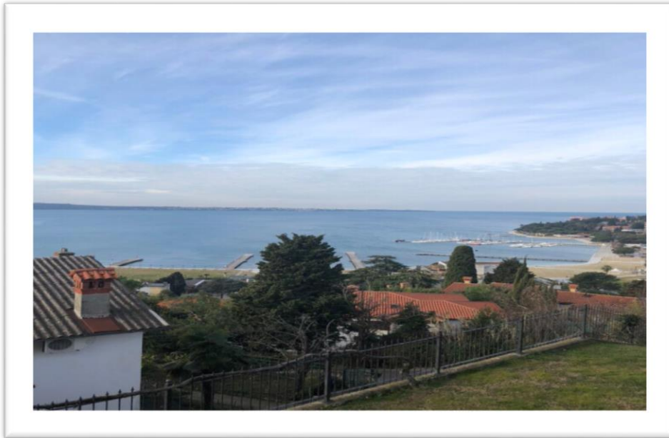
Picture: Sea coast

about its traditions and legends. They have showed me all the beautiful and gorgeous places they could in the short time we had and they also told me more about their language.