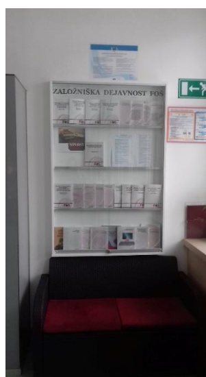
Picture: Jean Monnet Workshop Program and FOŠ board with publications