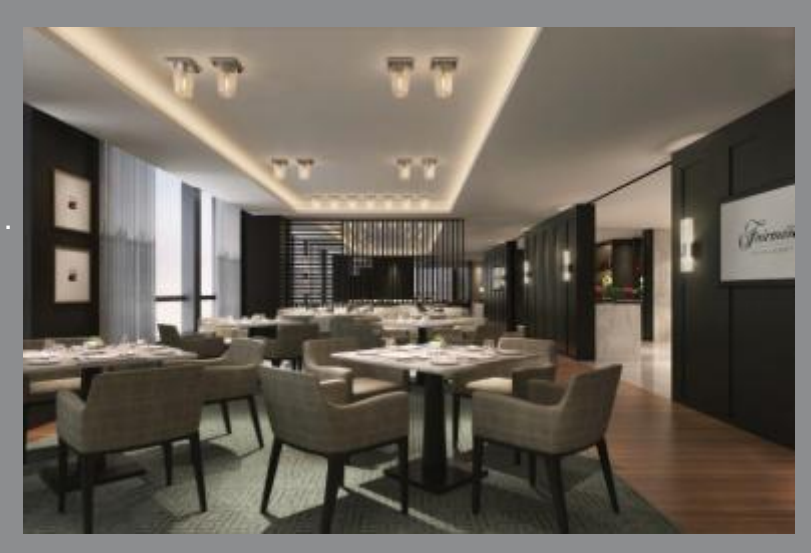
FAIRMONT GOLD LOUNGE

Your Fairmont Gold experience begins the moment you arrive at the private Fairmont Gold reception desk. Here, your individuality is valued, your room preferences are honored, and your arrangements for a quick and effortless departure are anticipated. In the exclusive Fairmont Gold Lounge, our dedicated team extends a friendly, sincere welcome and ensures that your every need is met.